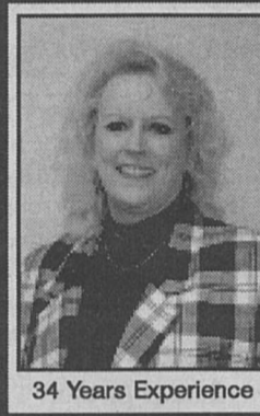
34 Years Experience